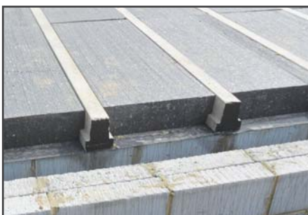
The distinctive Beamshield Plus locking ridge makes fitting simple and accurate

Read more at: www.charconcs.com/flooring