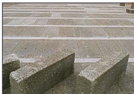
Beam and Block flooring is a robust solution for any floor especially those bearing heavier loads