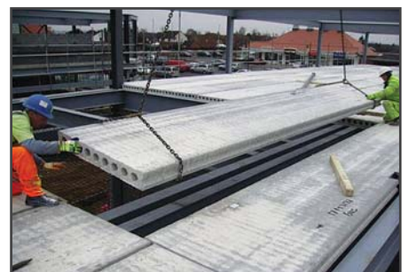
Hollowcore is the quick, reliable flooring solution suitable for most projects