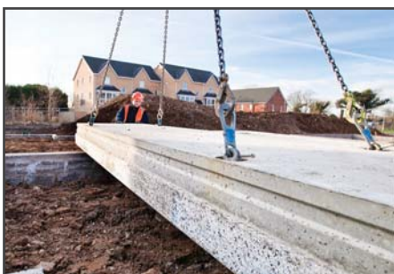
Spantherm's unique insulated underside and ready to use top side