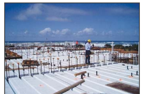
Quad-Deck is suitable for all flooring as well as flat and garden roofs