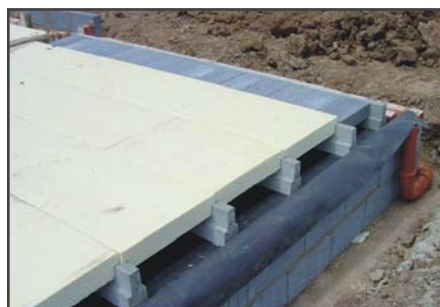
TETRIS® beam and insulated block suspended ground floor system