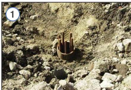
Pile positions are relayed to the design office to ensure accuracy

Each beam is uniquely marked for quick identification so that they can be rapidly offloaded and placed into position. Designed by our experienced engineers, each project is programmed to be installed in the most efficient sequence to ensure speedy assembly. Cast in grout tubes and joints are filled using high-strength non-shrink grout and the installation is complete.