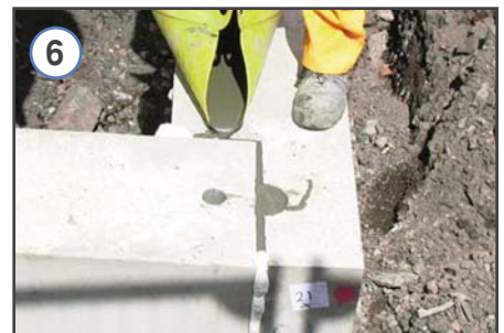
Joints filled using non-shrink grout