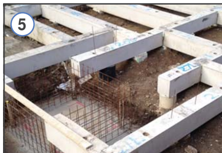
Beams are fitted around lift and stair shaft foundations