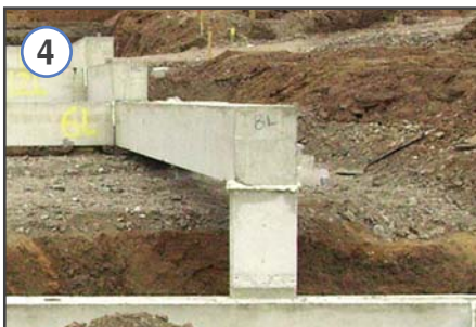
Stepped levels and service holes can be incorporated