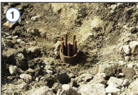
Pile positions are relayed to the design office to ensure accuracy

Each beam is uniquely marked for quick identification so that they can be rapidly offloaded and placed into position. Designed by our experienced engineers, each project is programmed to be installed in the most efficient sequence to ensure speedy assembly. Cast in grout tubes and joints are filled using high-strength non-shrink grout and the installation is complete.