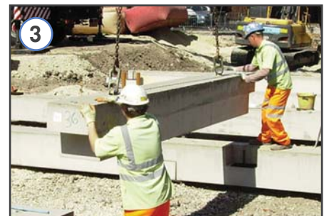
Rapid offloading and placing into position